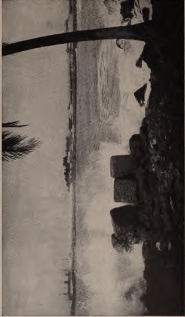
"The Atlantic breaking with its ages-old, mysterious roll"